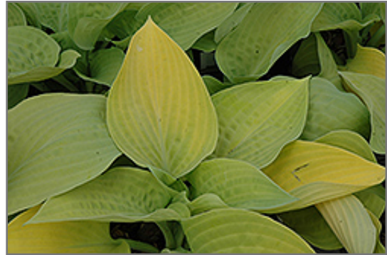
Chesterland Gold Hosta foliage