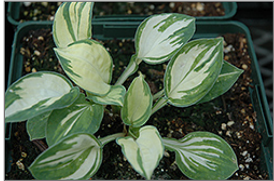
Cherish Hosta foliage