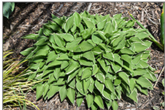
Cheesecake Hosta