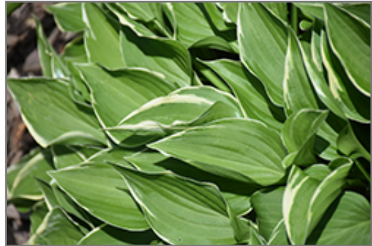
Cheesecake Hosta

Cheesecake Hosta is recommended for the following landscape applications;