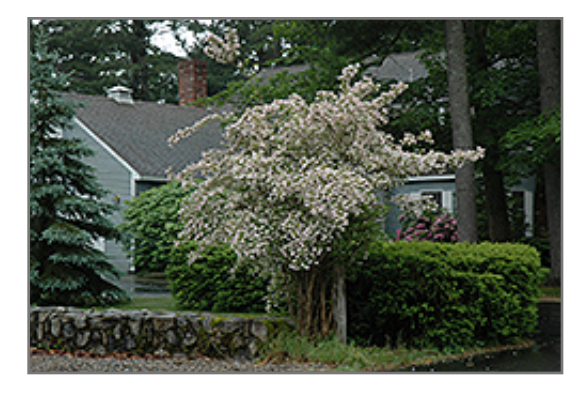
Pink Cloud Beautybush in bloom

Pink Cloud Beautybush is a multi-stemmed deciduous shrub with an upright spreading habit of growth. Its average texture blends into the landscape, but can be balanced by one or two finer or coarser trees or shrubs for an effective composition.