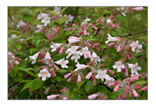
Pink Cloud Beautybush flowers

This shrub will require occasional maintenance and upkeep, and should only be pruned after flowering to avoid removing any of the current season's flowers. It is a good choice for attracting hummingbirds to your yard, but is not particularly attractive to deer who tend to leave it alone in favor of tastier treats. It has no significant negative characteristics.