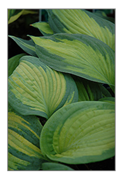
Brother Stefan Hosta foliage