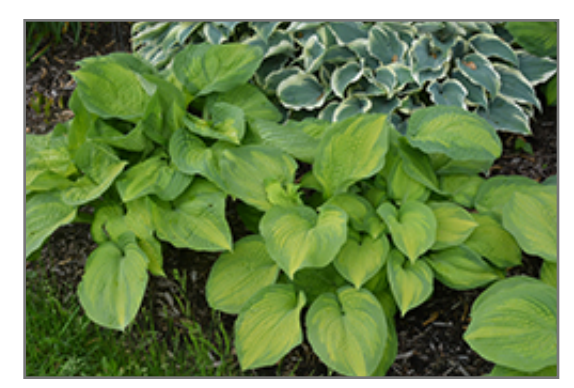
Brother Stefan Hosta