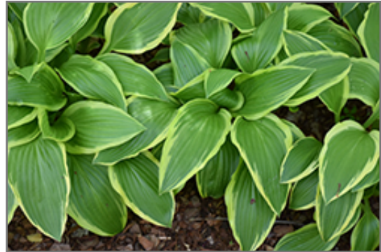
Bold Ribbons Hosta foliage