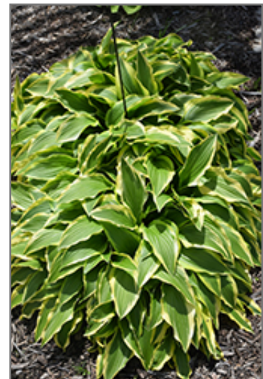
Bold Ribbons Hosta