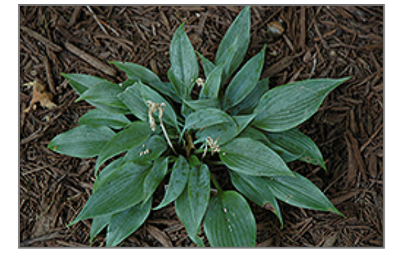
Blue Baron Hosta