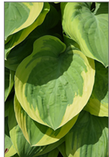
Bedazzled Hosta foliage