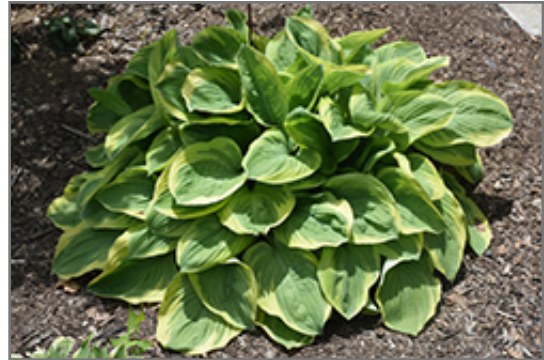
Bedazzled Hosta