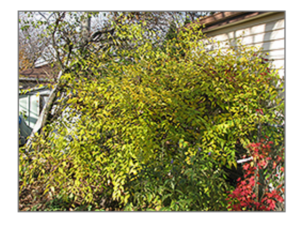
Double Flowered Japanese Kerria in fall

This shrub performs well in both full sun and full shade. It does best in average to evenly moist conditions, but will not tolerate standing water. It is not particular as to soil type or pH. It is highly tolerant of urban pollution and will even thrive in inner city environments. This is a selected variety of a species not originally from North America.