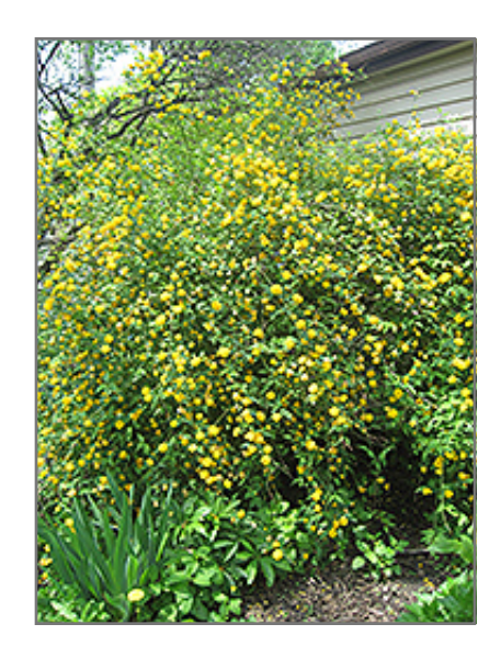
Double Flowered Japanese Kerria