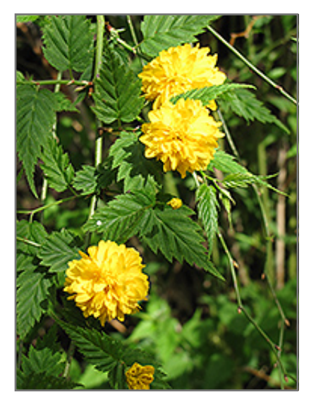
Double Flowered Japanese Kerria flowers

This is a high maintenance shrub that will require regular care and upkeep, and should only be pruned after flowering to avoid removing any of the current season's flowers. Deer don't particularly care for this plant and will usually leave it alone in favor of tastier treats. Gardeners should be aware of the following characteristic(s) that may warrant special consideration;