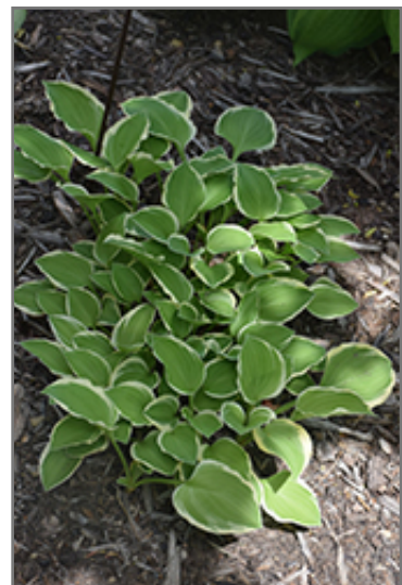
Avalanche Hosta