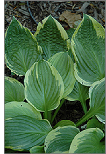
Avalanche Hosta foliage

Avalanche Hosta is recommended for the following landscape applications;