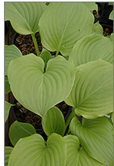
Aphrodite Hosta foliage