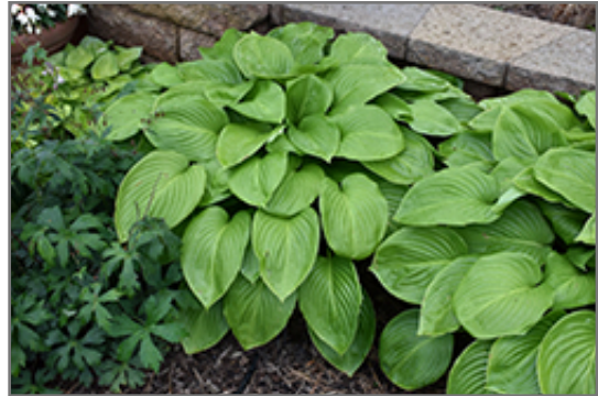
Aphrodite Hosta

Aphrodite Hosta is recommended for the following landscape applications;