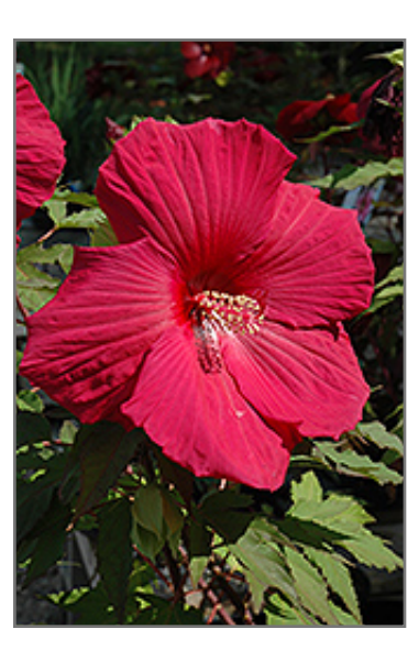
Sultry Kiss Hibiscus flowers

This bold garden perennial features showy ruffled, large hot pink flowers that are produced at the nodes all up the stems; attractive, glossy, dark-green/bronze leaves; ideal for the mixed garden border or in mass; do not allow to dry to wilting point