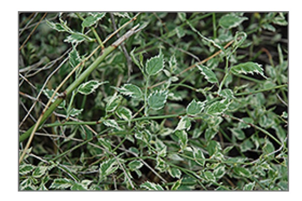
Picta Japanese Kerria foliage