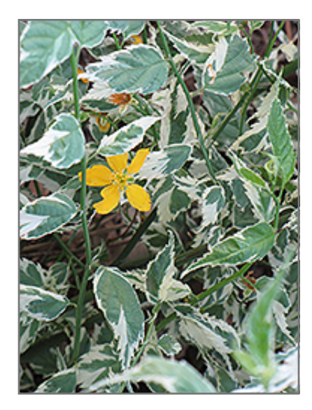
Picta Japanese Kerria flowers

This is a high maintenance shrub that will require regular care and upkeep, and should only be pruned after flowering to avoid removing any of the current season's flowers. Deer don't particularly care for this plant and will usually leave it alone in favor of tastier treats. Gardeners should be aware of the following characteristic(s) that may warrant special consideration;