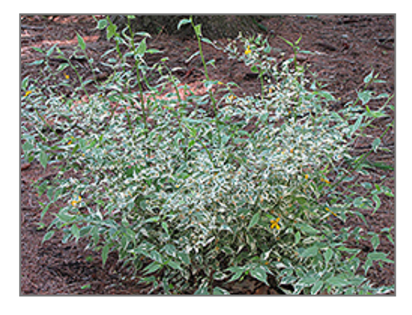
Picta Japanese Kerria

This shrub performs well in both full sun and full shade. It does best in average to evenly moist conditions, but will not tolerate standing water. It is not particular as to soil type or pH. It is highly tolerant of urban pollution and will even thrive in inner city environments. This is a selected variety of a species not originally from North America.