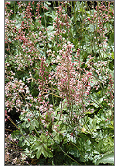
Strike It Rich Pink Gem Foamy Bells in bloom

Strike It Rich Pink Gem Foamy Bells is recommended for the following landscape applications;