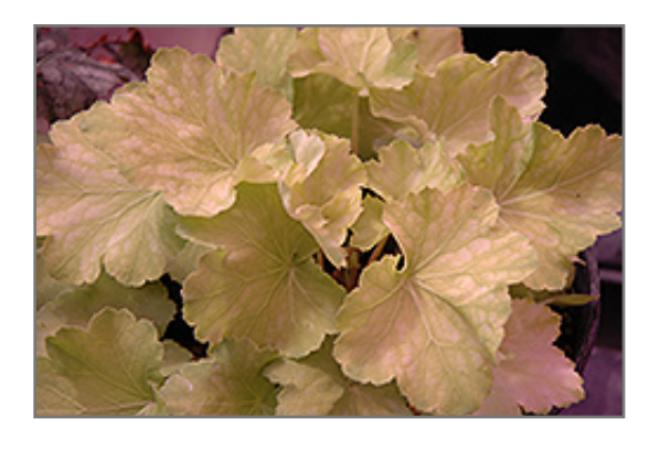
Tara Coral Bells foliage