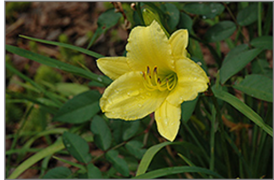
Moontraveler Daylily flowers