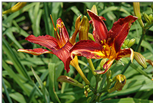
Crimson Pirate Daylily flowers