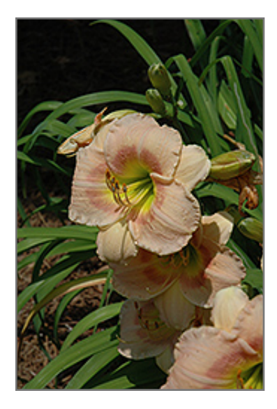
Bacon Michelle Yant Daylily flowers

Outstanding, large, shell pink trumpets with a dark pink band and yellow throat; diploid; sturdy, strong, easy to care for, great grassy texture and form; good for the beginner gardener and the pro