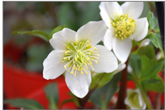
Gold Collection Jacob Hellebore flowers