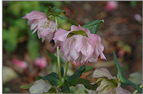
Ballerina Hellebore flowers

Ballerina Hellebore is recommended for the following landscape applications;