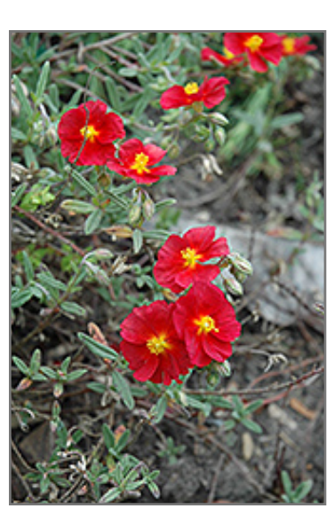
Wisley Primrose Rock Rose flowers

A charming variety for the rock garden, gravel scree, alpine trough, or as edging along a sunny walkway; spectacular pale yellow flowers appear in late spring through mid summer above silvery gray-green foliage; lightly shear after blooming