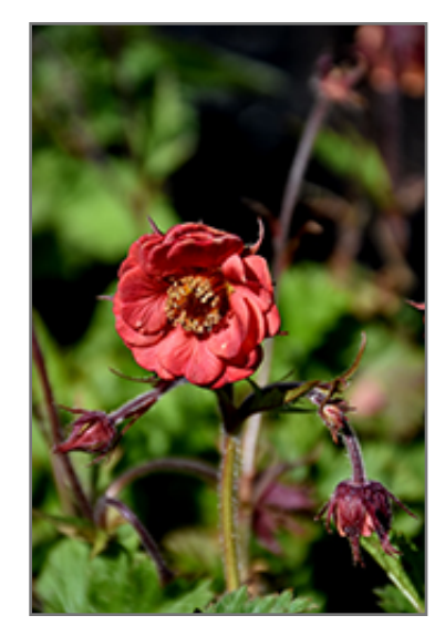
Flames of Passion Avens flowers

Flames of Passion Avens is an herbaceous perennial with tall flower stalks held atop a low mound of foliage. Its relatively fine texture sets it apart from other garden plants with less refined foliage.