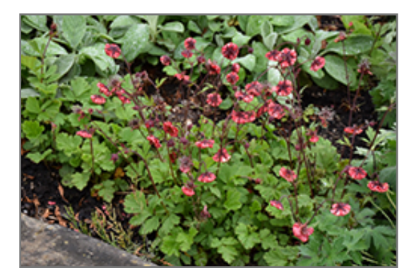
Flames of Passion Avens in bloom

This is a relatively low maintenance plant, and should be cut back in late fall in preparation for winter. It is a good choice for attracting butterflies to your yard, but is not particularly attractive to deer who tend to leave it alone in favor of tastier treats. It has no significant negative characteristics.