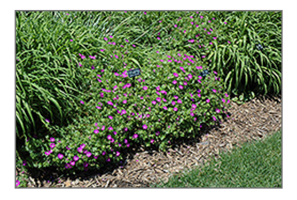
New Hampshire Purple Cranesbill in bloom