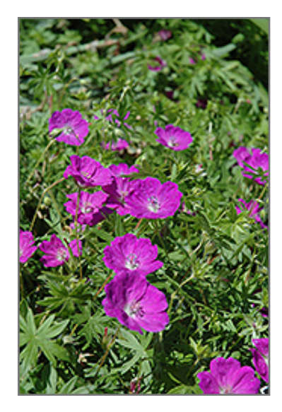
New Hampshire Purple Cranesbill flowers

This is a relatively low maintenance plant, and should only be pruned after flowering to avoid removing any of the current season's flowers. Deer don't particularly care for this plant and will usually leave it alone in favor of tastier treats. It has no significant negative characteristics.