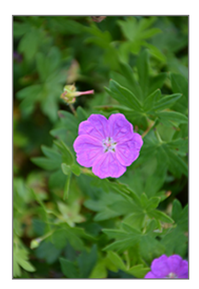
New Hampshire Purple Cranesbill flowers

New Hampshire Purple Cranesbill will grow to be about 18 inches tall at maturity, with a spread of 3 feet. When grown in masses or used as a bedding plant, individual plants should be spaced approximately 30 inches apart. Its foliage tends to remain dense right to the ground, not requiring facer plants in front. It grows at a medium rate, and under ideal conditions can be expected to live for approximately 10 years. As an herbaceous perennial, this plant will usually die back to the crown each winter, and will regrow from the base each spring. Be careful not to disturb the crown in late winter when it may not be readily seen!