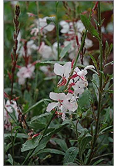
Ballerina Blush Gaura flowers

This is a relatively low maintenance plant, and is best cleaned up in early spring before it resumes active growth for the season. It is a good choice for attracting butterflies to your yard, but is not particularly attractive to deer who tend to leave it alone in favor of tastier treats. It has no significant negative characteristics.