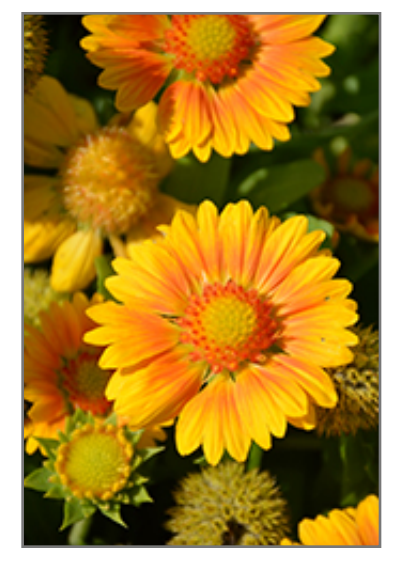
Gallo Peach Blanket Flower flowers

Bright peach and yellow flowers with brick red centers contrast beautifully with its fuzzy gray-green leaves; a profuse bloomer that will bloom all summer with deadheading; attracts butterflies, great for cutting, heat tolerant and deer resistant