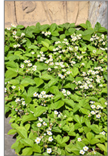
Common Wild Strawberry in bloom

Common Wild Strawberry features dainty white cup-shaped flowers with yellow eyes along the stems from late spring to early summer. Its attractive tomentose round compound leaves remain green in colour throughout the season. It features an abundance of magnificent cherry red berries from late spring to late summer.