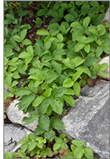
Common Wild Strawberry