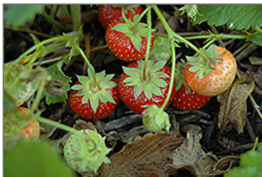
Common Wild Strawberry

Common Wild Strawberry features dainty white cup-shaped flowers with yellow eyes along the stems from late spring to early summer. Its attractive tomentose round compound leaves remain green in colour throughout the season. It features an abundance of magnificent cherry red berries from late spring to late summer.