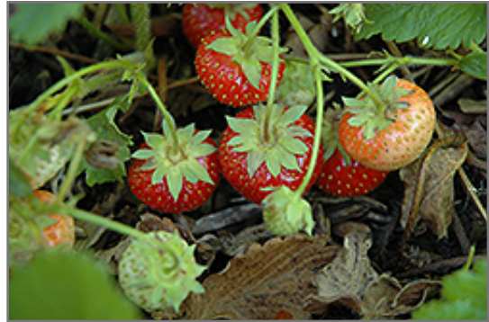
Common Wild Strawberry

Common Wild Strawberry features dainty white cup-shaped flowers with yellow eyes along the stems from late spring to early summer. Its attractive tomentose round compound leaves remain green in colour throughout the season. It features an abundance of magnificent cherry red berries from late spring to late summer.