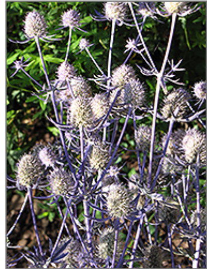
Jade Frost Variegated Sea Holly flowers

Jade Frost Variegated Sea Holly will grow to be about 8 inches tall at maturity extending to 24 inches tall with the flowers, with a spread of 15 inches. When grown in masses or used as a bedding plant, individual plants should be spaced approximately 12 inches apart. Its foliage tends to remain low and dense right to the ground. It grows at a medium rate, and under ideal conditions can be expected to live for approximately 10 years. As an herbaceous perennial, this plant will usually die back to the crown each winter, and will regrow from the base each spring. Be careful not to disturb the crown in late winter when it may not be readily seen!