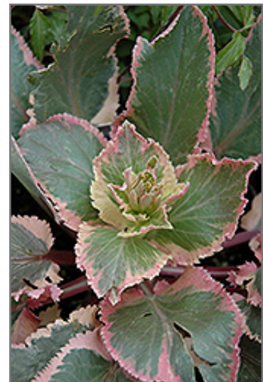
Jade Frost Variegated Sea Holly foliage