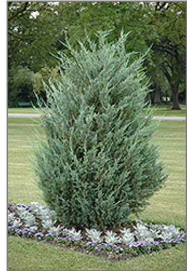
Moonglow Juniper