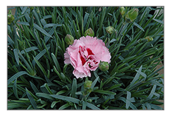
Scent First Raspberry Surprise Pinks flowers

Scent First Raspberry Surprise Pinks is an herbaceous evergreen perennial with a mounded form. It brings an extremely fine and delicate texture to the garden composition and should be used to full effect.