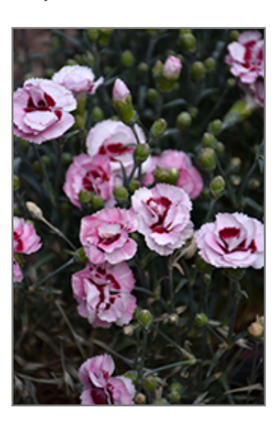
Scent First Raspberry Surprise Pinks flowers