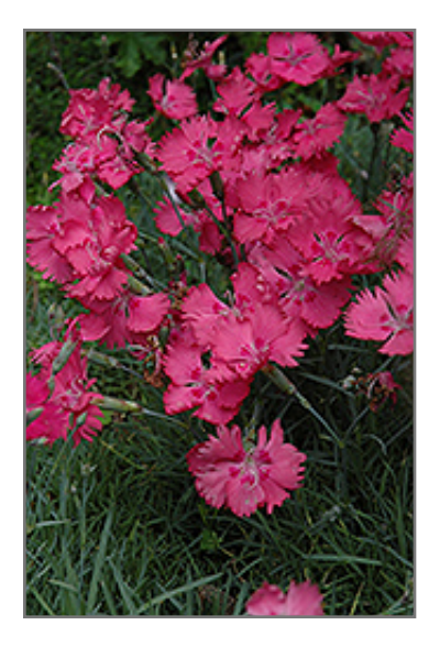
Grandiflorus Cheddar Pinks flowers

This stunning variety bursts into a mass of larger than usual hot pink blooms from late spring through the summer; quickly grows to form a dense weed stopping mound; regular dead heading extends blooming until fall