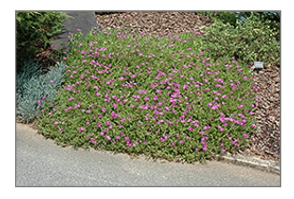
Purple Ice Plant in bloom

Purple Ice Plant will grow to be only 2 inches tall at maturity extending to 3 inches tall with the flowers, with a spread of 24 inches. Its foliage tends to remain low and dense right to the ground. It grows at a fast rate, and under ideal conditions can be expected to live for approximately 5 years. As an evegreen perennial, this plant will typically keep its form and foliage year-round.