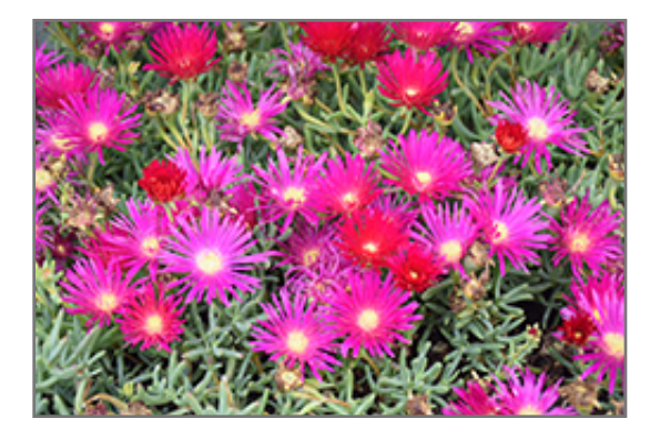
Purple Ice Plant flowers