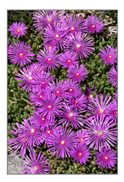
Purple Ice Plant flowers

This is a relatively low maintenance plant, and is best cleaned up in early spring before it resumes active growth for the season. It is a good choice for attracting bees and butterflies to your yard, but is not particularly attractive to deer who tend to leave it alone in favor of tastier treats. It has no significant negative characteristics.