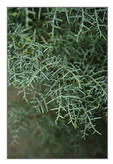
Himalayan Cypress foliage