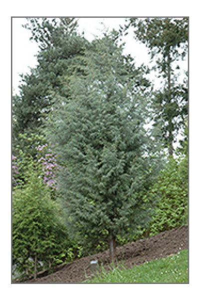
Himalayan Cypress