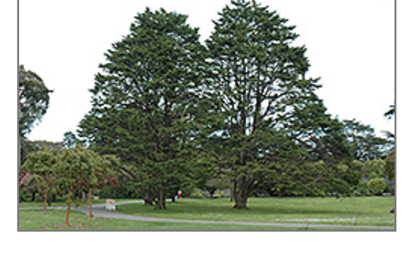
Monterey Cypress

Monterey Cypress will grow to be about 35 feet tall at maturity, with a spread of 30 feet. It has a low canopy with a typical clearance of 3 feet from the ground, and should not be planted underneath power lines. It grows at a medium rate, and under ideal conditions can be expected to live for 60 years or more.