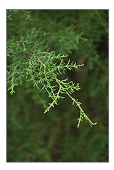
Gowen Cypress foliage