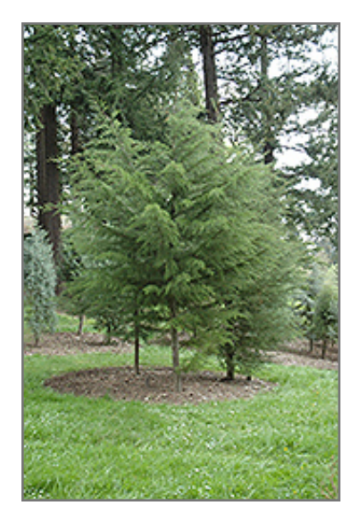
Gowen Cypress