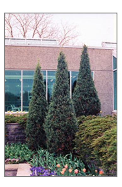
Skyrocket Juniper

An extremely narrow, rigid tall evergreen shrub, with soft blue-green needle-like foliage all season long; use with caution, can be rather abrupt in the landscape, makes a curious, almost formal tall evergreen hedge when planted in a row