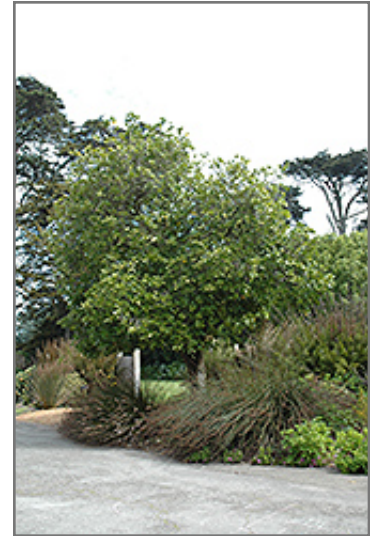
New Zealand Laurel