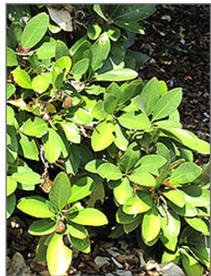
New Zealand Laurel foliage