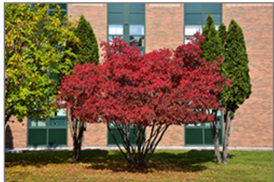
Amur Maple in fall