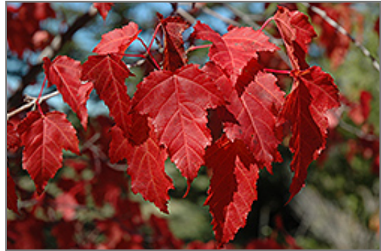
Amur Maple in fall