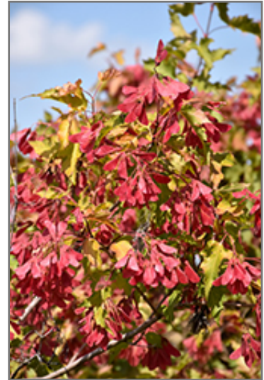
Amur Maple fruit

This tree does best in full sun to partial shade. It is very adaptable to both dry and moist locations, and should do just fine under average home landscape conditions. It is not particular as to soil type or pH. It is highly tolerant of urban pollution and will even thrive in inner city environments. This species is not originally from North America.