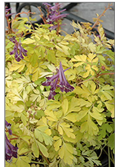
Berry Exciting Corydalis in bloom