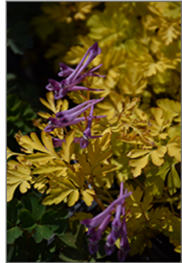
Berry Exciting Corydalis flowers