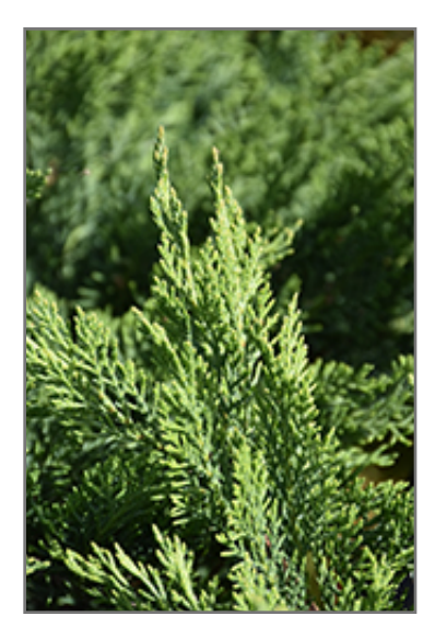
Tam Juniper foliage