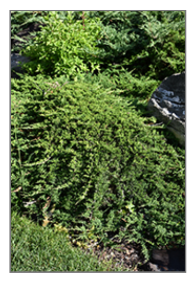
Tam Juniper