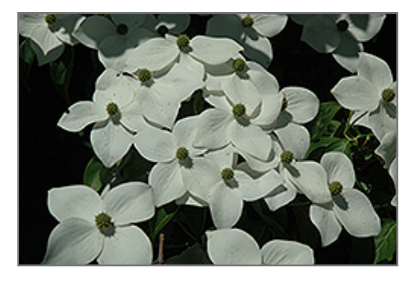
Kay's Appalachian Mist Flowering Dogwood flowers

This is a relatively low maintenance tree, and should only be pruned after flowering to avoid removing any of the current season's flowers. It is a good choice for attracting birds to your yard. Gardeners should be aware of the following characteristic(s) that may warrant special consideration;