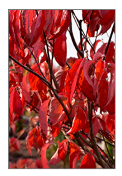
Kay's Appalachian Mist Flowering Dogwood in fall