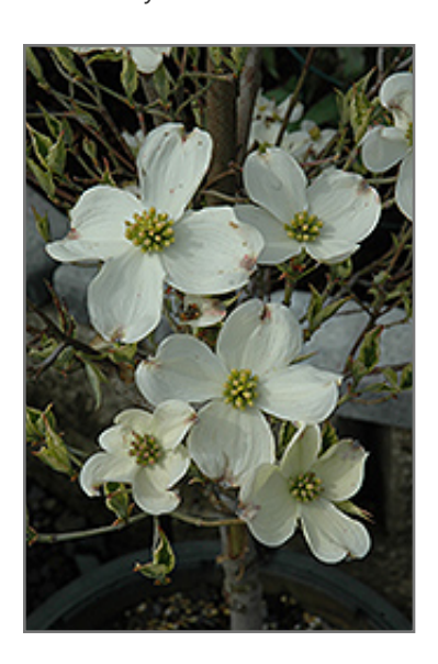
Cherokee Daybreak Flowering Dogwood flowers