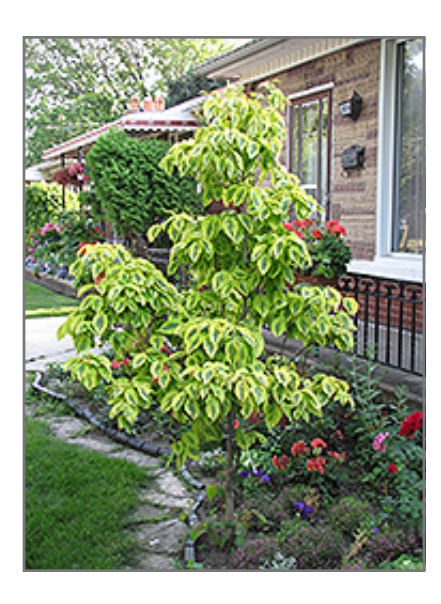
Cherokee Daybreak Flowering Dogwood

Cherokee Daybreak Flowering Dogwood is recommended for the following landscape applications;