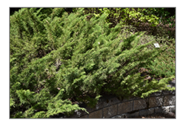
Skandia Juniper

Skandia Juniper is recommended for the following landscape applications;