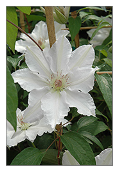
Hyde Hall Clematis flowers

Hyde Hall Clematis features bold white star-shaped flowers with shell pink overtones, lime green eyes and red anthers at the ends of the branches from late spring to early summer. It has light green deciduous foliage. The compound leaves do not develop any appreciable fall colour.