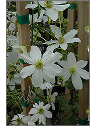
Early Sensation Clematis flowers

Early Sensation Clematis features bold white star-shaped flowers with lime green eyes and chartreuse anthers at the ends of the branches in mid spring. It has green deciduous foliage. The lobed compound leaves do not develop any appreciable fall colour.