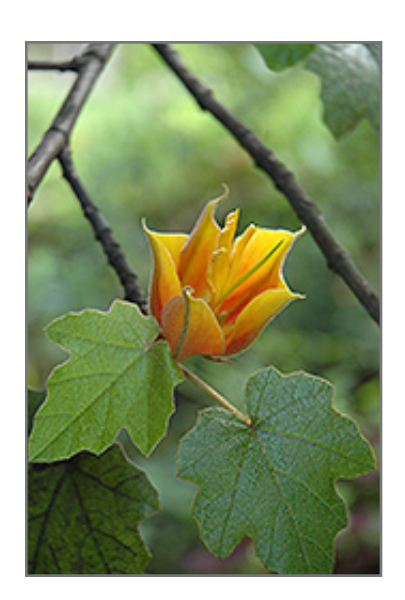
Monkey Hand Tree flowers

Monkey Hand Tree will grow to be about 30 feet tall at maturity, with a spread of 30 feet. It has a low canopy with a typical clearance of 3 feet from the ground, and should not be planted underneath power lines. It grows at a medium rate, and under ideal conditions can be expected to live for 50 years or more.