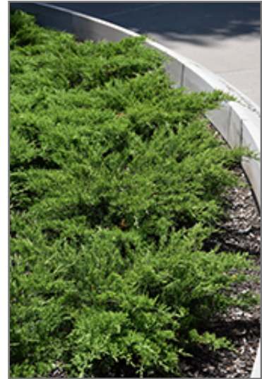
Broadmoor Juniper