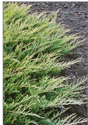
Broadmoor Juniper foliage