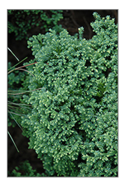
Plumosa Compacta Falsecypress foliage