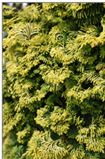
Dwarf Golden Hinoki Falsecypress foliage