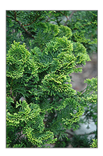
Aurora Hinoki Falsecypress foliage

Aurora Hinoki Falsecypress will grow to be about 8 feet tall at maturity, with a spread of 8 feet. It has a low canopy with a typical clearance of 1 foot from the ground, and is suitable for planting under power lines. It grows at a medium rate, and under ideal conditions can be expected to live for 70 years or more.