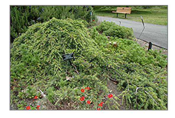
Weeping Cedar of Lebanon

A spectacular large shrub featuring beautiful dense horizontal and weeping branching with stunning bright green new foliage; ideal for form and texture in the shrub garden and worth seeking out